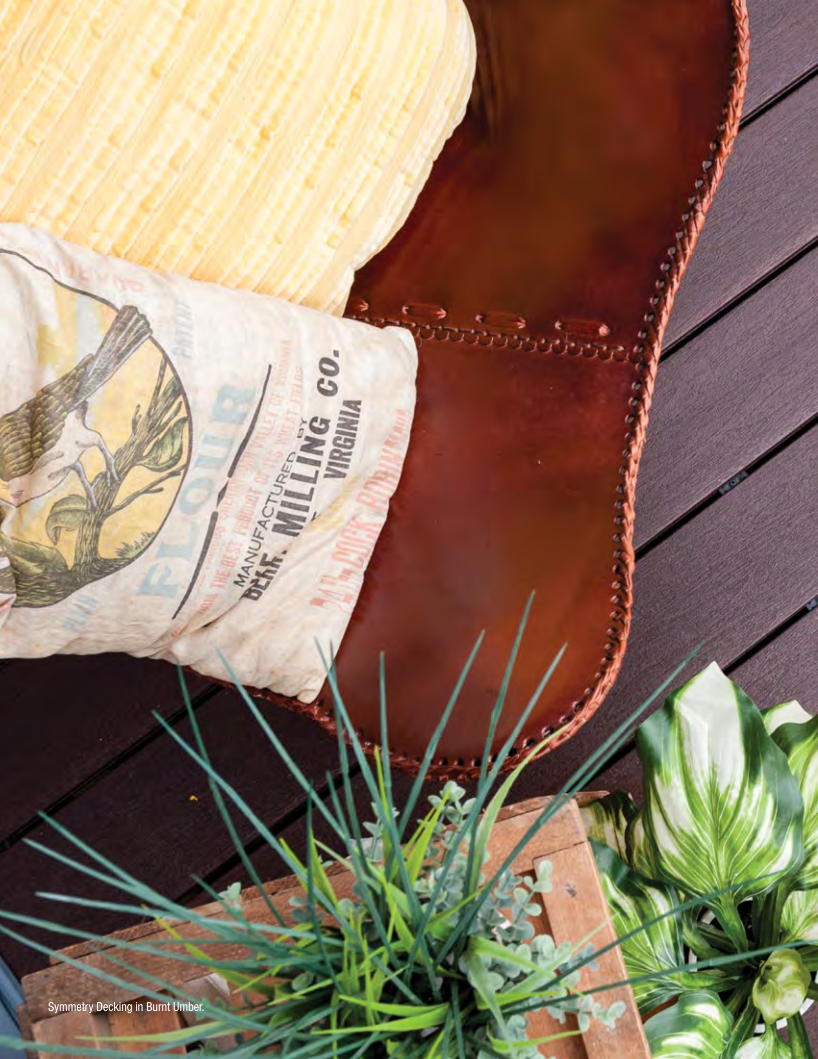
Symmetry Decking in Burnt Umber.