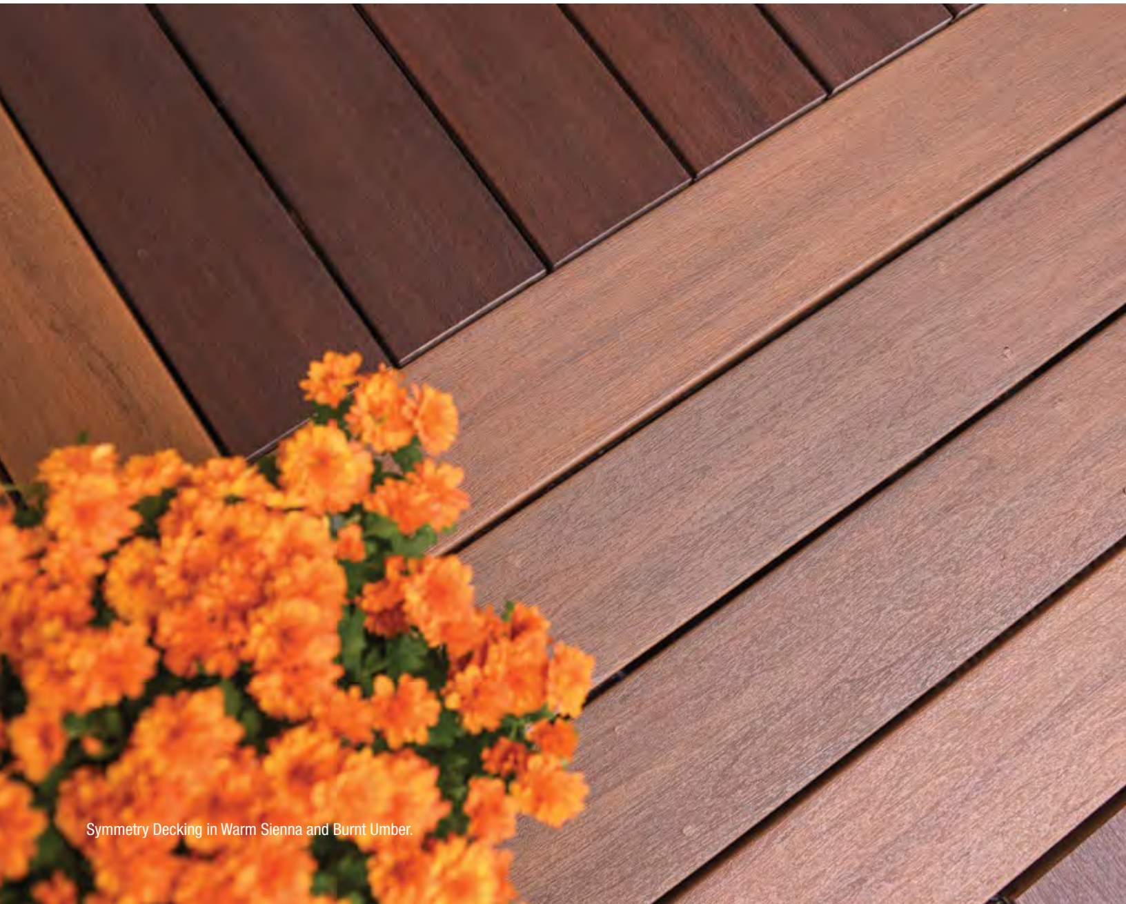
Symmetry Decking in Warm Sienna and Burnt Umber.